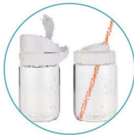
glass jar or plastic jar for choice