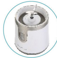
stainless steel blade