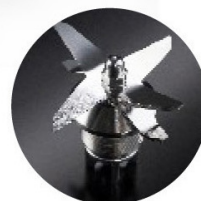
3d Heavy Duty Blade (Six Leaves)