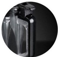
Patented Vacuum Blending Design