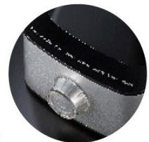
Knob Control Digital Panel