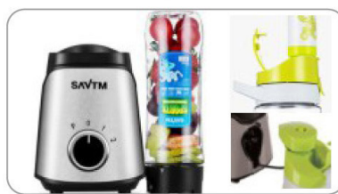
Travel cup can also work as a mixing cup using the detachable knife holder