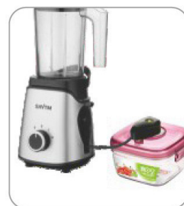
To extract the air inside of the vacuum containers and keep fresh