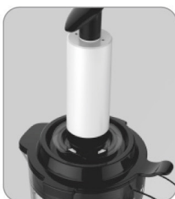
Using the manual pump to extract the inside air upper & lower for about 10 seconds