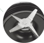
Stainless steel blade