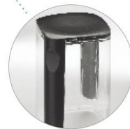
Noise reduction cover