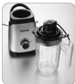
Using the electric pump after power on.

Pls turn the valve firstly, then you can drink the fresh juice.