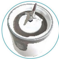
safety micro switch