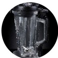
Vacuum Tritan Blender Jar