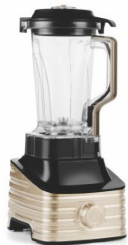
BR230-12E00 ( PMMA Housing )