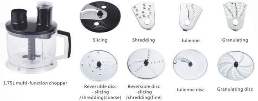
1.75L multi-function chopper Slicing Shredding Julienne Granulating Reversible disc -slicing /shredding(coarse) Reversible disc -slicing /shredding(fine) Julienne disc Granulating disc