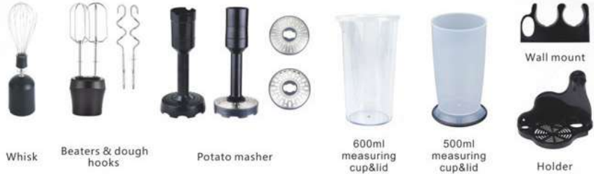
Whisk Beaters & dough hooks Potato masher 600ml measuring cup&lid 500ml measuring cup&lid Wall mount Holder