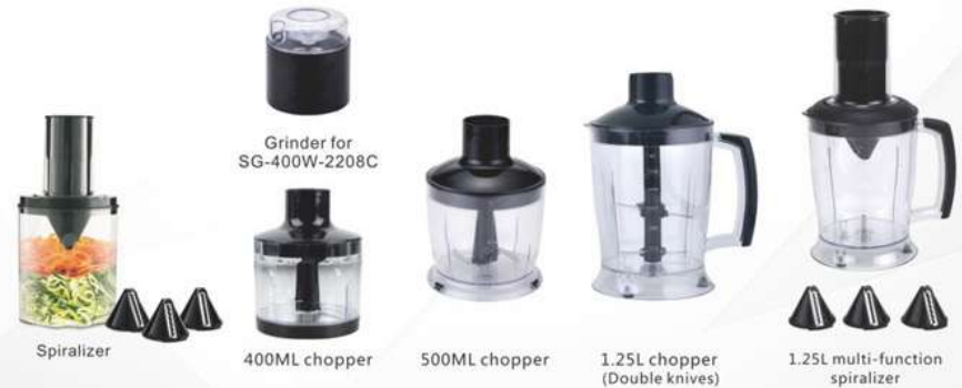
Spiralizer Grinder for SG-400W-2208C 400ML chopper 500ML chopper 1.25L chopper (Double knives) 1.25L multi-function spiralizer